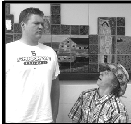
The size difference between myself and most Texans...

I recently went to Texas, and while there I made an observation, that the quote "everything in Texas is bigger," must be referring to waste line instead of height. Every place that I went, my head was colliding with the ceiling, archways, and even shower heads.