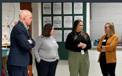
Picture: Marinette School District taking a tour and learning more about our Child Care Center